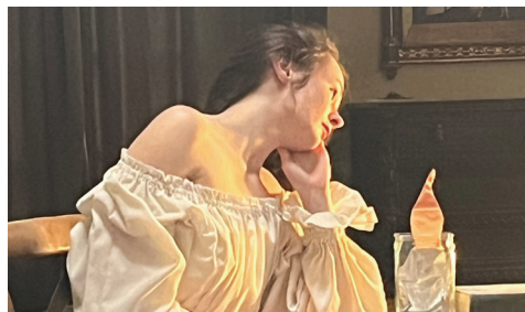
Another fabulous presentation of Tableaux Vivants in the Studio this past August!